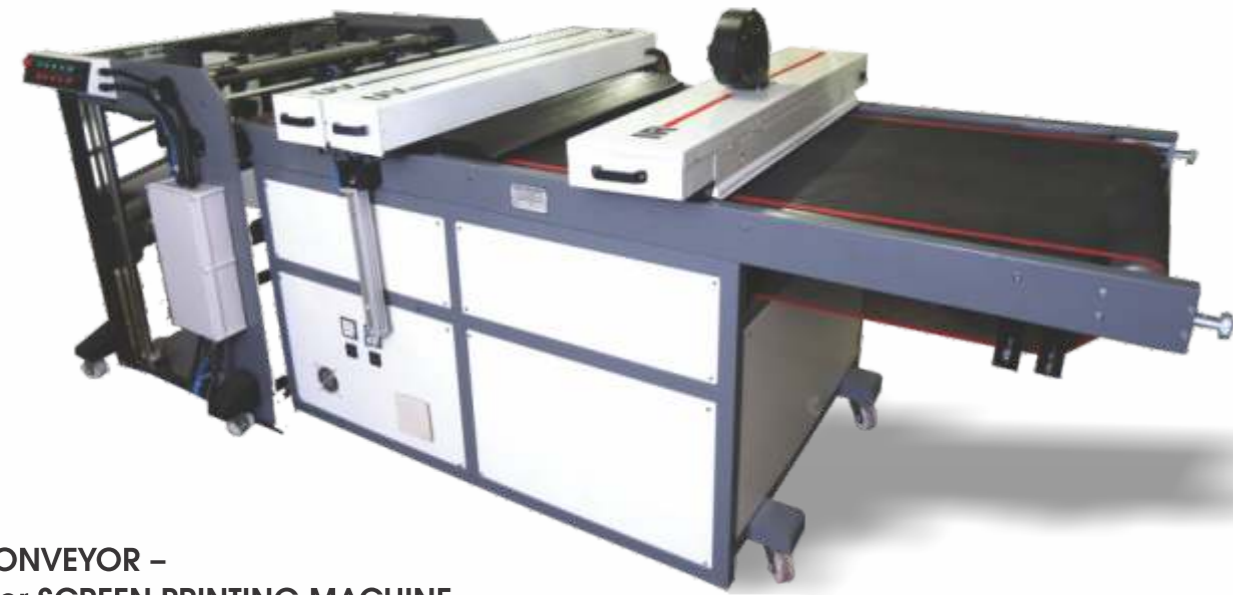
UV CONVEYOR – Best for SCREEN PRINTING MACHINE & PCB