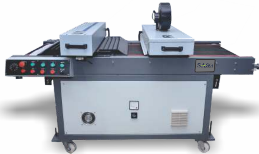
Table Top- Mini UV CURING SYSTEM

Table top machines are manufacturing in strict technical specifications and offer compact design for easy mobility and installation. These are also fitted with a heat resistant mesh conveyor belt to reduce the heat transfer.